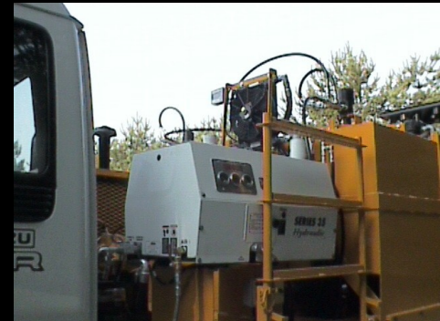
35 CFM rotary screw hydraulic driven air compressor