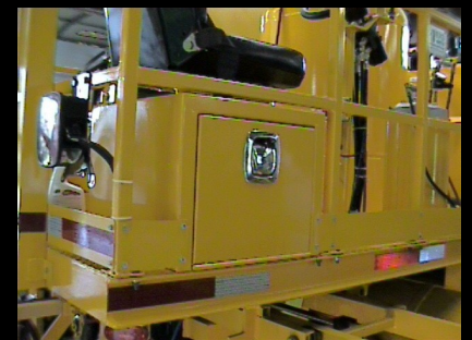
Seats are mounted on toolboxes