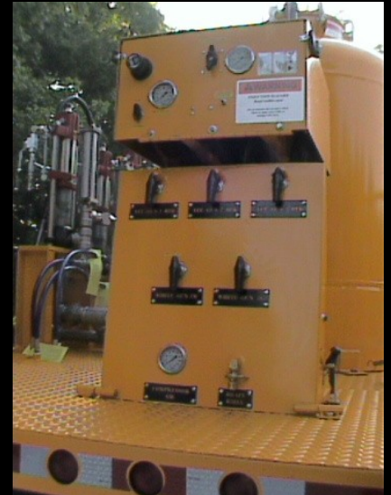
Control console with panel-mounted valves