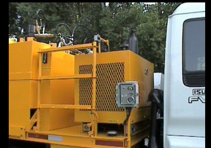
Kubota engine cover with removable side panels for access